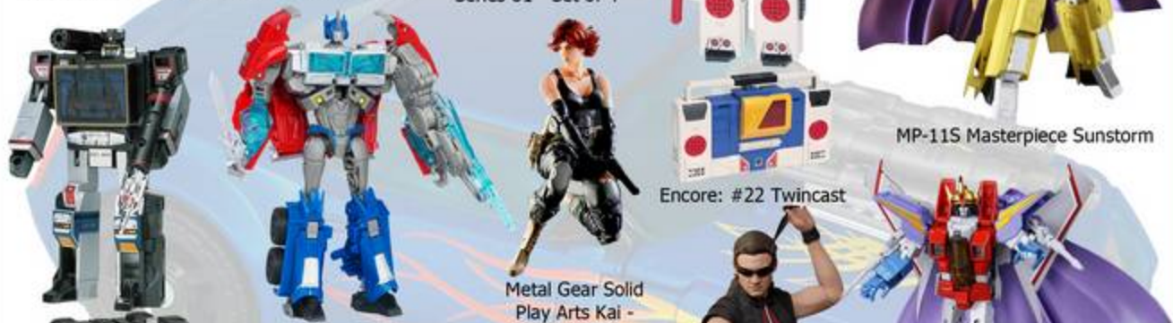
MP-11S Masterpiece Sunstorm