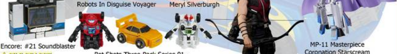
Encore: #21 Soundblaster