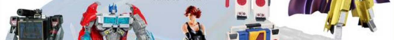
MP-11S Masterpiece Sunstorm