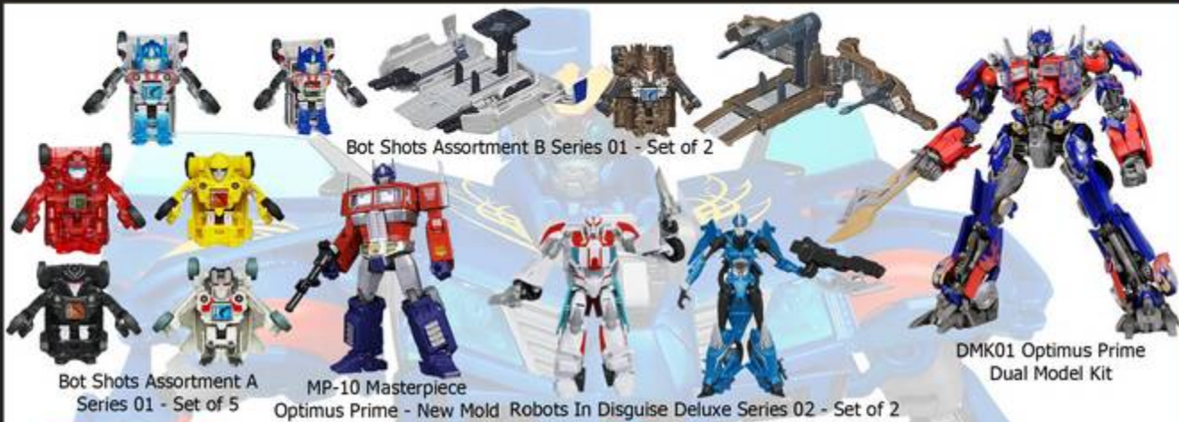
Bot Shots Assortment B Series 01 - Set of 2