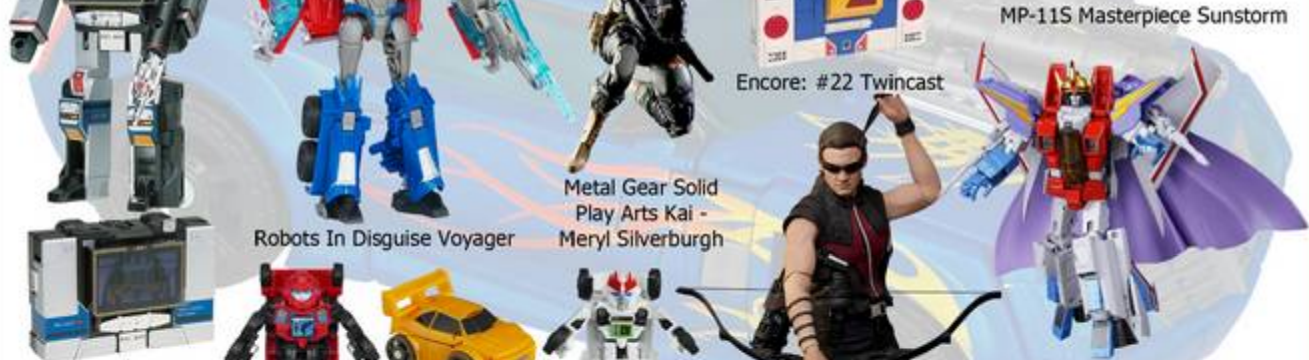
Encore: #21 Soundblaster