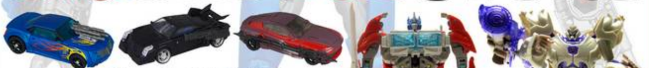
Robots In Disguise Deluxe Series 03 - Set of 3